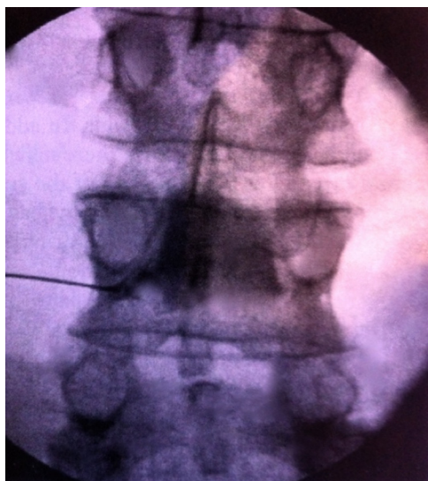
Fig. 1 – Intrathecal contrast injection in transforaminal lumbar approach. (Color version of figure is available online.)

Direct needle-induced spinal cord damage is logically more frequent at cervical level and tends to be very serious, particularly when material is injected into the cord. In a recent study, Rathmell et al reviewed the incidents associated with cervical procedures for the treatment of chronic pain incidents reported between 2005 and 2008. Of the 64 identified complications, 59% corresponded to spinal cord damage. Most such problems (31%) were due to direct needle-induced injury. 21 These complications are related to techniques performed under deep sedation or general anesthesia and can occur with both the TF and the IL approaches. Neurologic damage is not necessarily severe or permanent, and patients may experience reversible paresis.